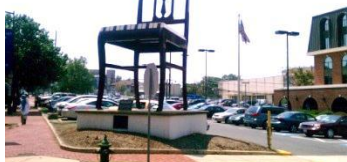
Big Chair- Landmark Anacostia, SE Washington