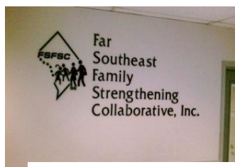
Lunch at the Far SE Collaborative